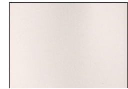
REF: SKIN N°11