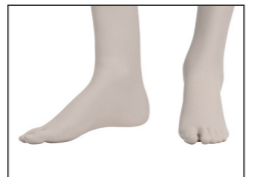
FLAT FEET (OPEN TOES)