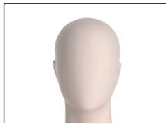
EGGHEAD REF: M2