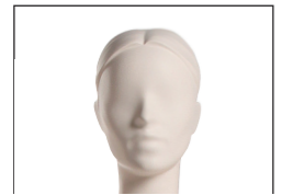
ABSTRACT WITH SCULPTED HAIR HEAD REF: AP