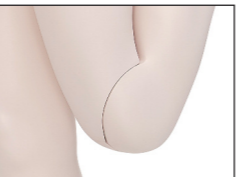
*ARTICULATED KNEE: 120 05 - 120 06 - 120 10

FITTINGS & BASES: CALF FITTING INCLUDED (FOOT FITTING NOT AVAILABLE) METAL BASE INCLUDED (GLASS BASE NOT AVAILABLE)